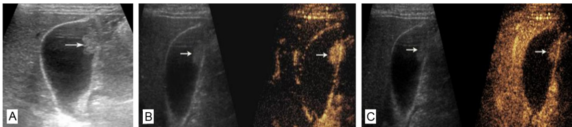
Figure 2. Conventional ultrasound and CEUS images of gallbladder adenoma. A: A hyperechoic nodule is present in the body of the gallbladder wall on conventional ultrasound. The diameter of the lesion (arrow) is about 1.7 cm; B, C: CEUS images: 13 s after injection of contrast agent, lesion appears hyperenhancement and the gallbladder wall structure beneath the lesion is intact (B); 45 s after injection of contrast agent, the lesion becomes hypo-enhancement (C).

was also found in all 9 patients with gallbladder adenoma canceration ( P > 0.05 ).