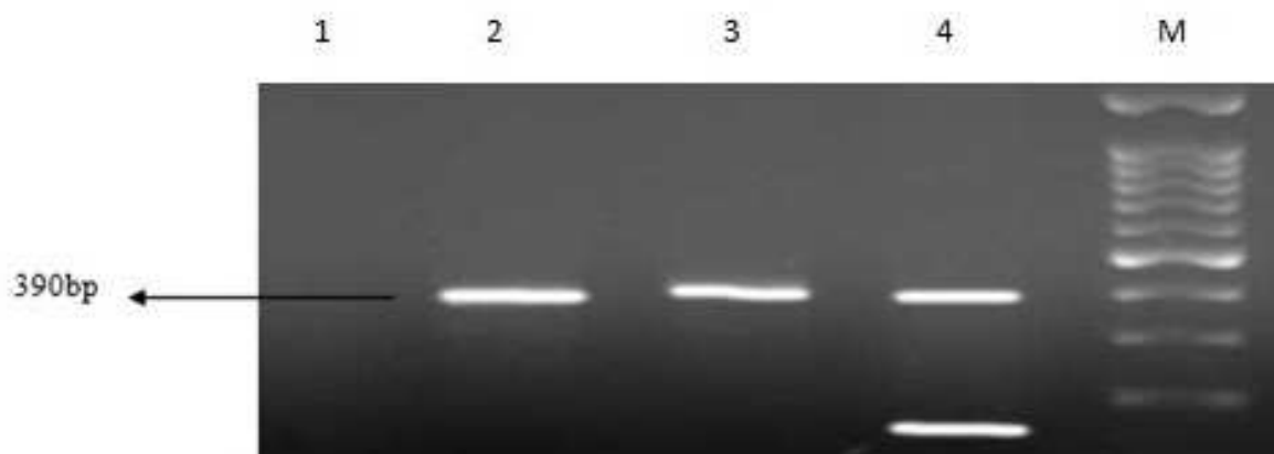
Fig. 1. Multiplex PCR amplification fragments for the detection of vim and imp gene among Acinetobacter baumannii isolates. Lane 1: negative control, lanes 2, 3: positive vim strains, lane 4: positive control of vim and imp genes and M: 1kb DNA size marker

According to many studies, A. baumannii is known as one of the most common Gram negative bacteria that can cause nosocomial infection in health care centers especially in burned hospitalized patients (2, 3, 8). Treatment of infection due to XDR A. baumannii is extremely difficult and causes more morbidity and motility in hospitalized burn