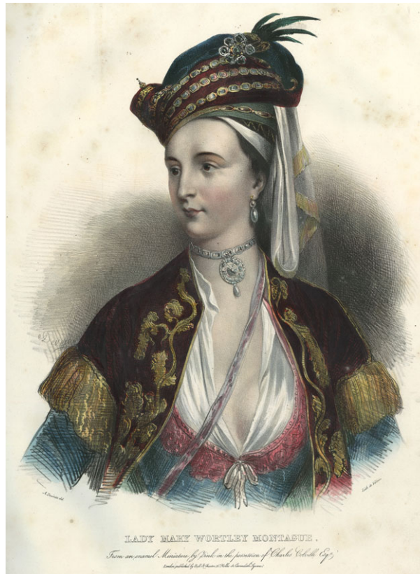
Figure 2. Lady Mary Wortley Montagu in Turkish costume.

Lady Mary Wortley Montagu, daughter of the Marquess of Dorchester, was a highly educated and independent minded person who mixed with literary and scientifically minded people and who kept a salon. In 1712, she escaped from an arranged marriage intended by her father by eloping with and marrying Sir Edward Wortley Montagu. In 1716, she went to live for two years in Turkey when her husband was appointed as British ambassador to the Ottoman court in Constantinople. She learned Turkish and Greek, visited the women in their segregated quarters, made friends and learned about Turkish customs. She wrote many ‘Letters from the Embassy’ (an eighteenth century form of blog) to her friends at home about her experiences [4]. In one written in April 1717, she describes a visit to Sofia, which was then part of the Ottoman Empire, where she went to the hammam (public baths):