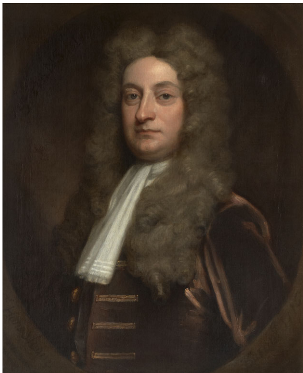
Figure 1. Sir Hans Sloane. Portrait by Godfrey Kneller, 1716.

cocoa beans of the New World and advocated the use of a concoction of cocoa, sugar and milk, which we know as chocolate, mostly as a medicinal beverage. In 1719, he became President of the Royal Society of Physicians London. He was also appointed physician-general to the army in 1722. He served as Secretary to the Royal Society (1693–1713) when he had editorial responsibility for Philosophical Transactions [3], and in 1727, he succeeded Sir Isaac Newton as President of the Society, stepping down from that post 13 years later at the age of 80.