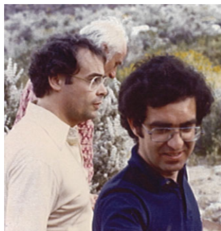
David Marr - in La Jolla, CA - 1974