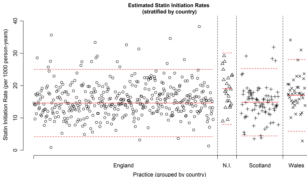
Figure 2 Plot showing the estimated statin therapy initiation rate for each of the 554 general practitioner practices, stratified by UK country. The solid red line indicates the sample mean statin therapy initiation rate within a country. The dashed red lines indicate this sample mean \pm 2SD (sample SD) within a country.

negatively associated with deprivation. 13 29 30 Examining data from 2010, Scotland has a higher rate of myocardial infarction than England, and similarly the North East and North West regions of England have higher rates of myocardial infarction with the South East and East of England reporting the lowest rates. 28 Although our study focused on statin prescription for primary prevention, our findings concur with some of these observations.