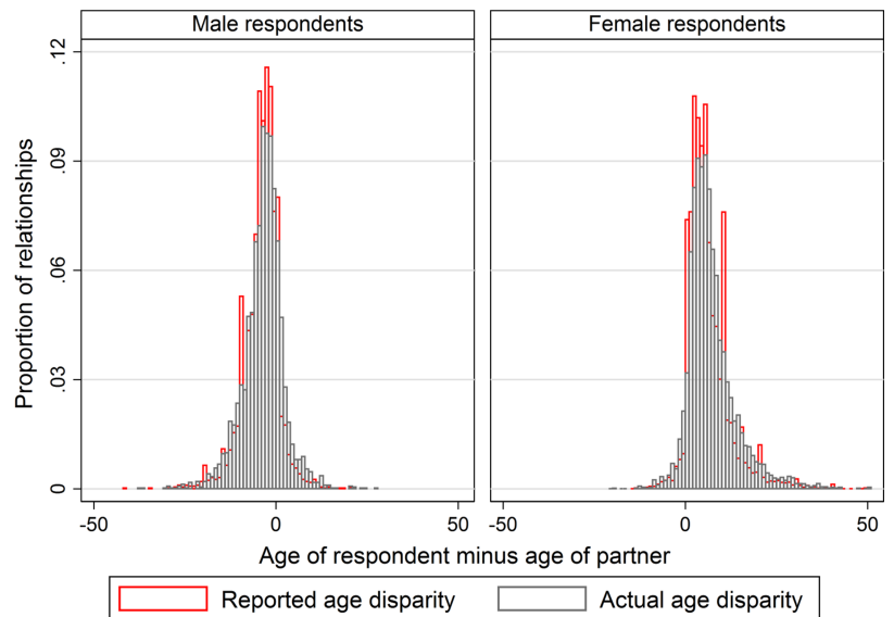
Figure 3 Distribution of reported and actual age disparities (in years), by gender. The proportion of relationships with actual (light grey bars) and reported (dark red bars) age disparities at each age difference are overlaid, so that areas where the red bars are clearly visible (close to zero, and at heaping values such as men being 5 years older) represent age disparities that are reported more often than they actually occur.

partner with women their own age, but older men partner with younger as well as same-aged women.