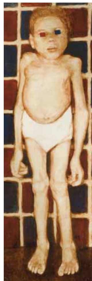
FIGURE 1. An art adapted photo of a typical Morquio syndrome patient by Peter Romberg

advocated for patients with Morquio syndrome independent of neurological symptoms [1, 5]. Cardiac abnormalities may be present. Aortic regurgitation is the most commonly observed valvular abnormality in patients with Morquio syndrome. However, few reports have been published describing cardiac surgery in patients with mucopolisaccharidosis, including Morquio syndrome, because valve disease becomes usually symptomatic only late in the course of these diseases [5]. MPS IV induced thoracic cage deformity, kyphoscoliosis, may reduce the long volumes and cause ventilation-perfusion mismatch [6]. Unlike other forms of mucopolysaccharidoses, MPS IV patients