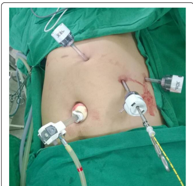
Figure 1 Port positions. 1, Camera port. 2, Epigastric port. 3, Left midclavicular port. 4, Lateral port.

The gallbladder was distended and surrounded by adhesions. The first assistant grasped the fundus of the gallbladder and pulled it upward and laterally via the left lateral port. The right-handed surgeon grasped Hartmann’s pouch and pulled it laterally using his left hand via the epigastric port and dissected the adhesion using his right hand via the left midclavicular port. Identification of Calot’s triangle was difficult because the anatomy could not be clearly identified as a result of the previous inflammation (Figure 2). Therefore, intraoperative cholangiography was performed, and no abnormal variations were demonstrated (Figure 3). After the cystic duct and artery had been individually clipped and divided safely, the gallbladder was separated from its bed by