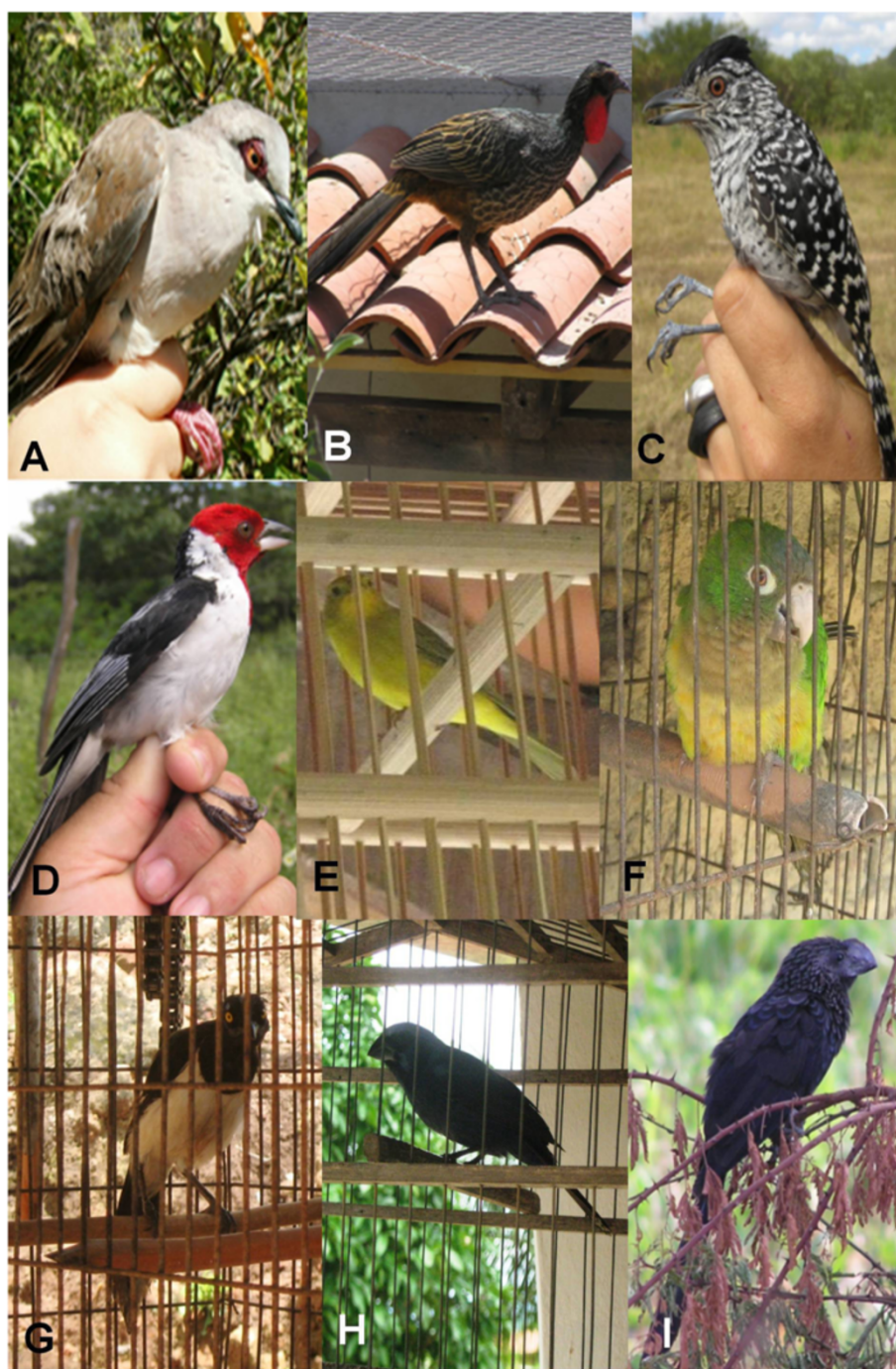
Figure 2 Some of the bird species captured by residents of Macaúba, Barbalha, Ceará for their meat: A – Leptotila verreauxi ; B – Penelope superciliaris ; C – Thamnophilus capistratus ; D – Paroaria dominicana ; E – Sicalis flaveola ; F – Eupsittula cactorum ; G – Cyanocorax cyanopogon ; H – Cyanoloxia brissonii ; I – Crotophaga ani .

other Brazilian localities [14,24,38]. In Bahia state, Costa-Neto [39] recorded the medicinal use of all three species cited in the present study. In two of these cases, only the feathers were exploited – those of C. cyanopogon for neurological problems, and of C. noctivagus for cases of epilepsy. The smooth-billed anu ( C. ani ) is used in two