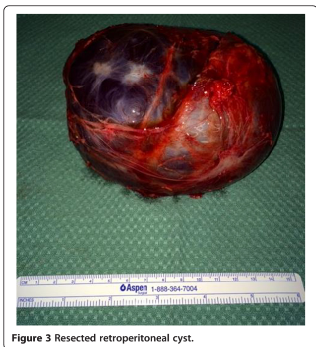
Figure 3 Resected retroperitoneal cyst.

sequelae of a mesenteric or omental haematoma or an abscess which was not resorbed [5,6].