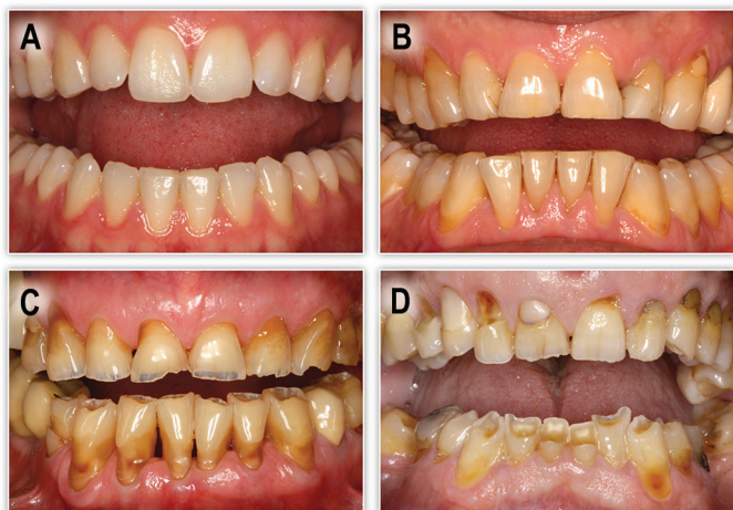
(A) Mild teeth wear, (B) moderate teeth wear, (C,D) severe teeth wear.