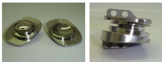
Kineflex metal-on-metal: (a) mechanism, (b) assembled