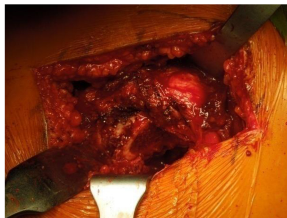
Figure 4 Showing the platform after osteotomy after the guide has been removed.

A total of 48 patients participated in the study. Gender, age, operative side and clinical data were collected for statistical analysis, with results showing no significant difference between the two groups (Table 1). Difference existed between the planning and postoperative osteotomy heights in both group, but the mean difference in group I (average, 0.84 mm) was significantly less than group II (average, 1.69 mm) ( P < 0.001 ) (Tables 2 and 3). Patients undergoing THA in group II had an average difference in osteotomy height of 1.69 mm, while group I had an average difference of only 0.84 mm, which was