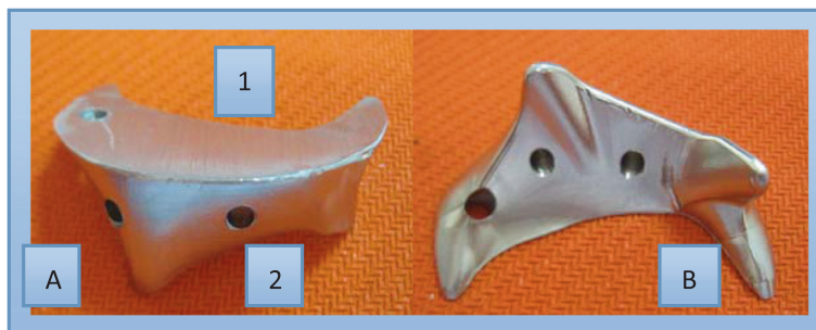
Figure 1 Femoral Neck Osteotomy Guide A: anterior view, B: posterior view. The guide device comprising two parts, the upper oriented platform (1) and the lower locating seat, which is attached to the top of the lesser femoral trochanter (2).

osteotomy height from 10 mm to 15 mm for each group. The series contains six models with a 1 mm interval difference between each two adjacent models. The different sizes of the osteotomy guides were selected according to preoperative templates on X-ray films, such as a 10-mm guide for a 10 mm osteotomy height, and the like. First, a model was made and modified on femur specimens using a self-curing denture acrylic. The model was then tested and adjusted on 128 femur specimens to obtain a suitable model form for a variety of femoral neck configurations. Finally the guide was made from titanium with a ratio of 1:1 according to the model. The guide was suitable for THA through a posterolateral approach. Before surgery, the device was sterilised with low temperature hydrogen peroxide gas plasma sterilisation.