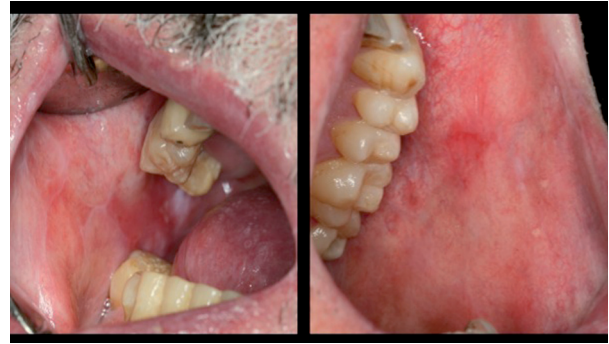
Fig. 3. Clinical features of oral cGVHD. Bilateral lichenoid lesions affecting buccal mucosa.

However, in the presence only of the distinctive clinical features without disease involvement in other organs, or if malignancy is suspected, an oral biopsy would be indicated with the purpose of establishing the diagnosis (17,20).