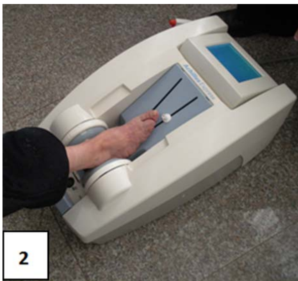
Figure 2 Heel quantitative ultrasound measurement in a woman with bound feet.

Owing to the large physical distance between Luliang County and Hong Kong (see online supplement 1) and as we lacked financial support for international travel, only two women with bound feet with mean QUS values representative of the bound feet group were invited to Hong Kong for case analysis using advanced