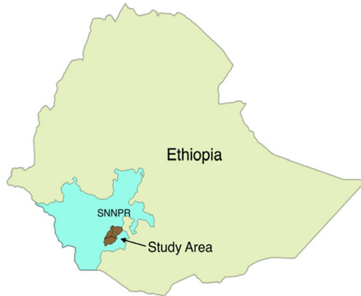
Fig 1. The map of the study area within southern Ethiopia.