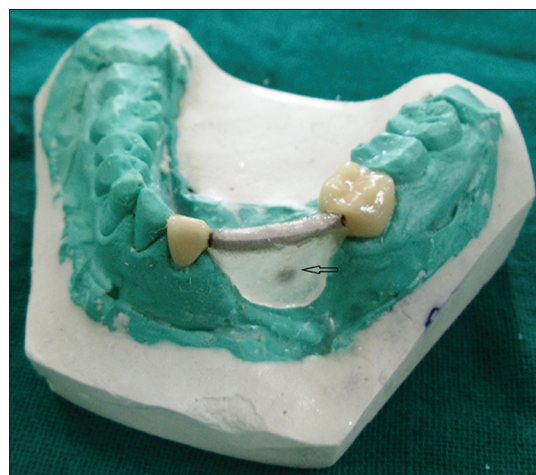
Figure 2: Fixed component with acrylic flange fabricated and magnet placed in it