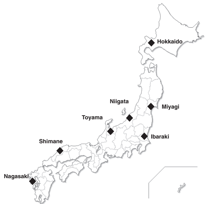
Figure 1. Study areas.

In general, air pollution particles secondarily generated from anthropogenic gases in the atmosphere, such as sulfate or nitrate, are spherical, but Asian dust particles are not. Because LIDAR can recognize shape differences by utilizing information about the polarization of scattered light, it is possible to measure non-spherical Asian dust particles separately from the spherical particles of other air pollutants. Therefore, LIDAR has been widely used in observations of Asian dust events in East Asian countries. The National Institute for Environmental Studies LIDAR network can estimate the dust extinction coefficients of the non-spherical and spherical components. 14