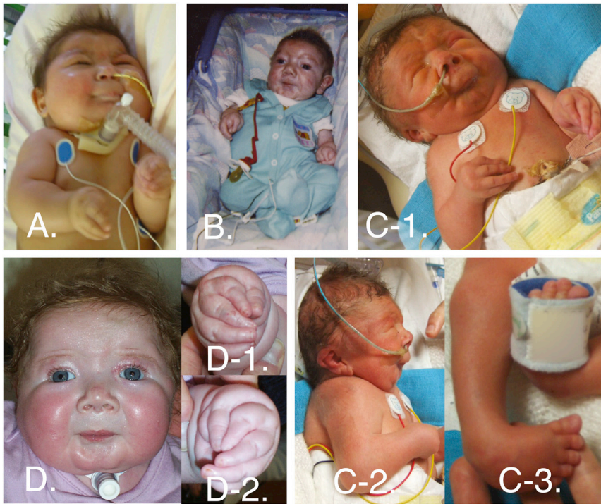
Figure 1. Phenotypic Characteristics of Each Individual with CLIFAHDD Syndrome Four individuals affected by CLIFAHDD syndrome; all individuals shown have NALCN mutations. Note the short palpebral fissures, flattened nasal root and bridge, large nares, long philtrum, pursed lips, H-shaped dimpling of the chin, and deep nasolabial folds (A, B, C 1 , D). Campodactyly of the digits of the hands and ulnar deviation of the wrist (A, B, C, D 1 , D 2 ) or clubfoot (C 3 ) is present in each affected person. Case identifiers for the individuals shown in this figure correspond to those in Table 1, where there is a detailed description of the phenotype of each affected individual. Figure S1 provides a pedigree of each CLIFAHDD-syndrome-affected family.

delay (Table 1, family K). We then co-expressed mutant and wild-type NALCN in HEK293T cells. Immunoblot analysis demonstrated that the expression of either the p.Tyr578Ser or p.Leu509Ser (GFP-tagged) NALCN alteration nearly eliminated wild-type (HA-tagged) NALCN protein (Figure 3).