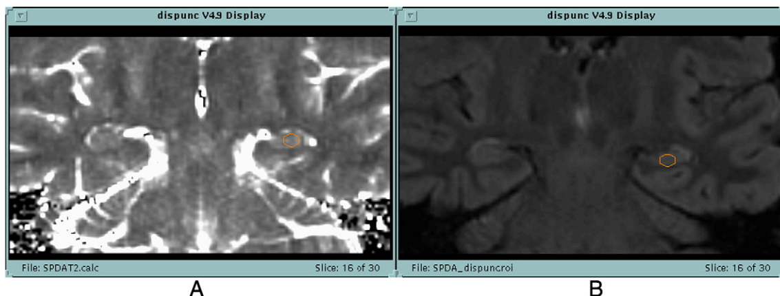
Fig. 1. Placement of ovoid ROIs on hippocampal slices of T2 map A and T2 FLAIR (B) images (Bartlett et al., 2007).

We applied the same method of analysis for images of both sequences in order to concentrate on comparison of the imaging techniques rather than the specificities of the analysis. The only difference –