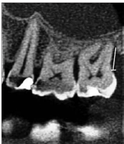
Figure 3: Sagittal cone beam tomograms showing the measurements of the distances from the cemento-enamel junction to the bottom of the defect in the distal surface of 27.