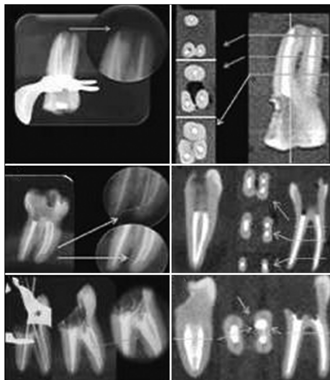
Figure 1: Cone beam computed tomography image detecting the presence of fractured instrument and root perforation on a molar tooth.

CBCT is an important investigative tool in diagnosing apical lesions supported by a few research studies that have shown that contrast-enhanced CBCT images can be used to differentiate between apical granulomas and apical cysts by measuring the lesion density. 13 It has applications in cases of differentiating the lesions of endodontic and non-endodontic origin. Inconspicuous cases of vertical root fractures are best diagnosed with CBCT. 14 It is more favored to periapical radiographs in the detection of fractures in mesiodistal or buccolingual directions, in the detection of horizontal root fractures, in the measurement of depth in dentin, for the better visualisation of fractured instrument and root perforation (Figure 1). Conventional 2D radiographs have limitations in detecting early stages of inflammatory root resorption, whereas CBCT has proved its