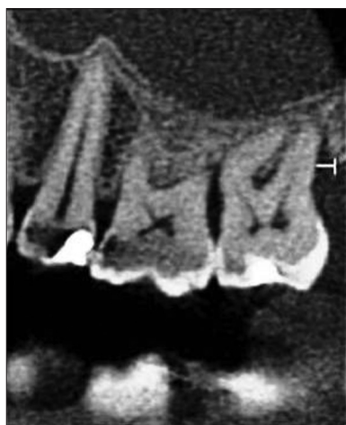
Figure 4: Sagittal cone beam tomograms showing the measurements of the width of the defect in the distal surface of 27.