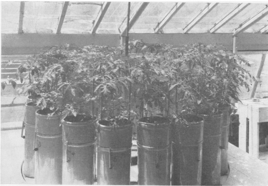
FIG. 3. Sand cultures mounted on a rotating table in unevenly lighted greenhouse.