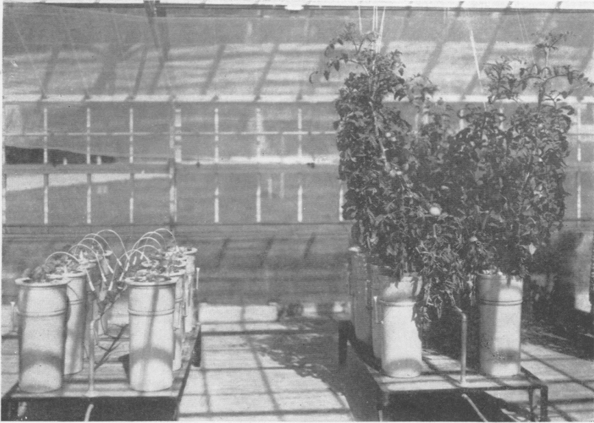
FIG. 2. Sand cultures on greenhouse benches.