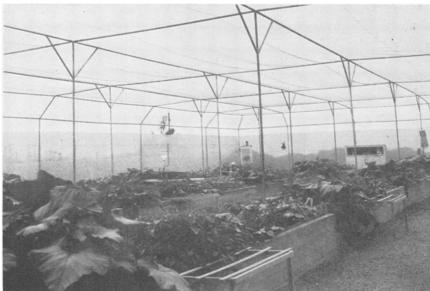
FIG. 4. Out-of-doors sand cultures for annual crops.

The new sand cultures for annual crops grown to maturity, figure 4, have dimensions similar to the one previously described (3, fig. 2) except that the