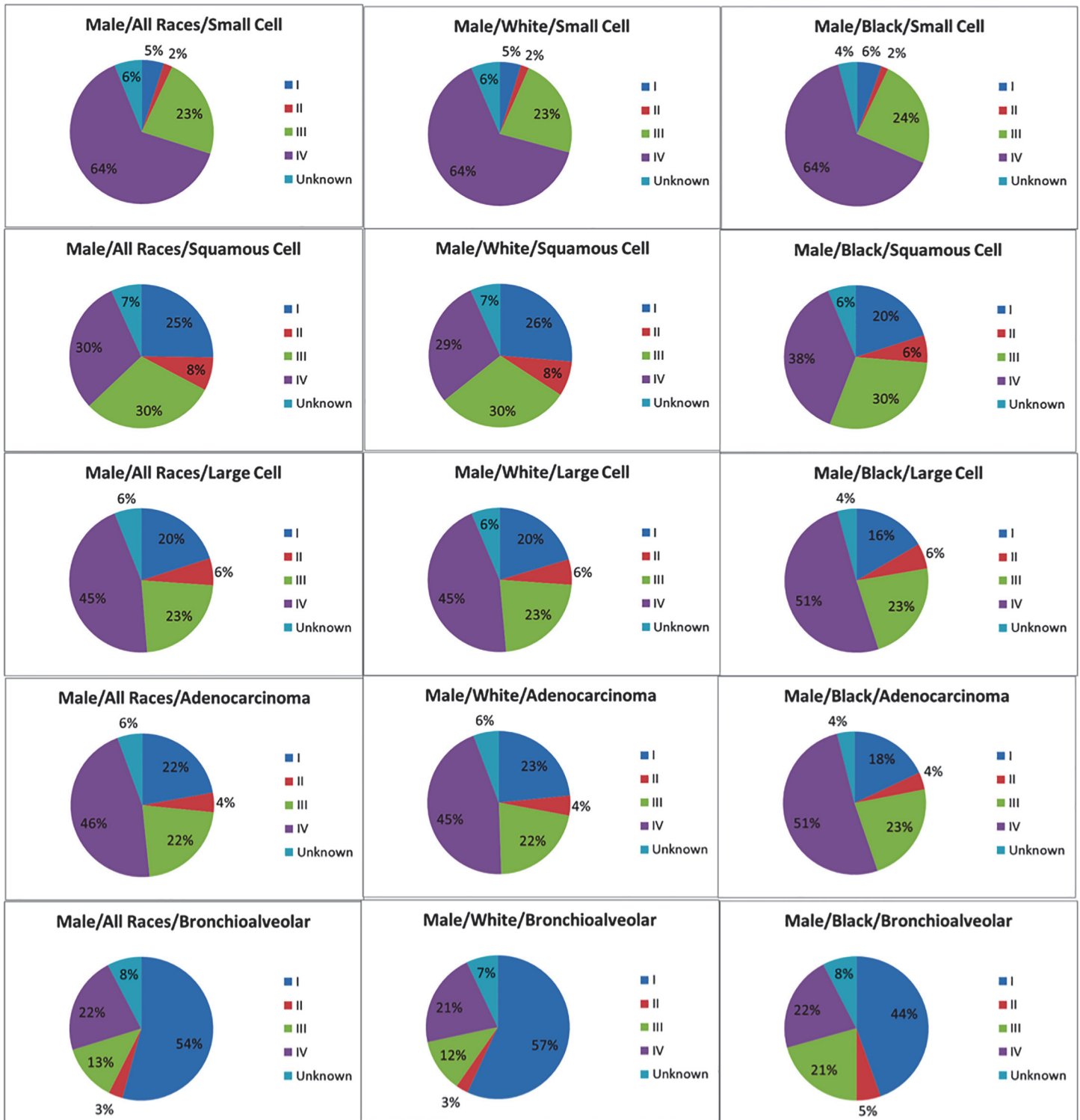
Fig 3. Stage distribution of male lung and bronchus cancer cases in the United States SEER 9 registry by race and histology, 2005–2010.