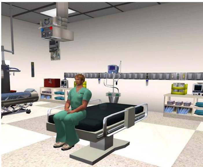
Figure 1. Avatar patient in an emergency department examination bay.

EM residents (n=35) were randomly assigned to one of two groups using a stratified approach to ensure that each group had an equal number of residents from each of three levels of training (PGY1-3). The first group was administered the oral examination using the immersive virtual interface with the examiner at a different physical location than the examinee (Figure 1). The second group served as a control and was administered the oral examination using the traditional format: a face-to-face patient case scenario that was managed with the examiner present in the same room as the examinee. Both groups were administered the same case scenario in which the examinee was expected to diagnose and manage a patient with ST-elevation acute myocardial infarction and resuscitate the patient after cardiac arrest. The study was reviewed and approved by our institution's behavioral sciences institutional review board.