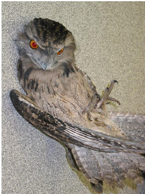
Fig. 2. Tawny frogmouth, Podargus strigoides , with severe posterior paresis and unable to right itself due to infection with Angiostrongylus cantonensis .

Twenty one species of Angiostrongylus and Angiostrongylus sp. are reported here from wildlife around the world, thirteen of them with no further details concerning intermediate and definitive host, geographic range, pathogenesis nor life cycle. Angiostrongylus cantonensis , A. costaricensis , A. dujardini , A. mackerrasae , A. malaysiensis and A. vasorum appear to be species on the move, spreading into regions where previously they did not occur. The life cycles, pathogenesis and geographic distributions of the two zoonotic species, A. cantonensis and A. costaricensis , have been studied in detail. The zoonotic potential of other species with complex migratory pathways in definitive hosts, like these three species, i.e. A. mackerrasae , A. malaysiensis and A. siamensis , are deserving of further study. It is surprising, given the increasing occurrence and debilitating effects of A. cantonensis in mammalian and avian wildlife in Australia, that