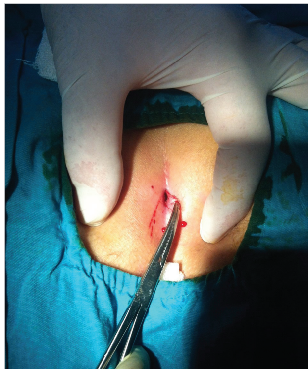
Figure 2. Extraction of hair from the cyst