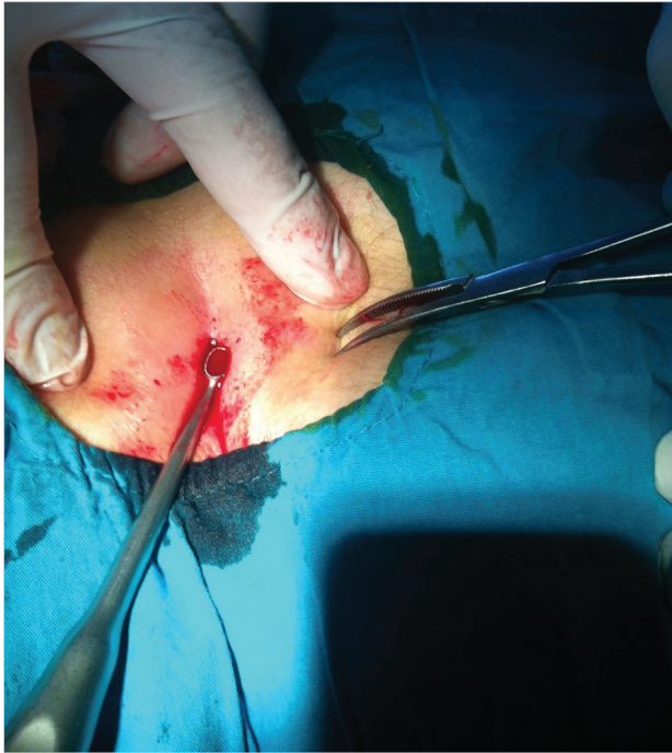
Figure 3. Curettage of cyst epithelium