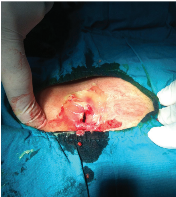
Figure 4. Protection of skin with nitrofurazone ointment

tion of the symptoms was 12.62 \pm 10.14 months in the Limberg group and was 9.76 \pm 5.73 months in the crystallized phenol group and there was no statistically significant difference between the two groups (Table 1).