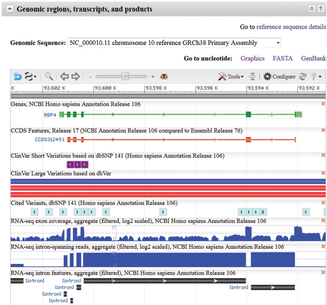
Figure 4. Genomic regions, transcripts and products section of the Full Report. The section for the human RBP4 gene is shown. This is an interactive display of the location of a gene annotated on a genomic RefSeq. More than one genomic RefSeq sequence may be available, and the gene's location on any can be displayed using the drop down menu at the top. Zoom and panning functions are enabled, and the tracks displayed can be configured using the 'Configure' button. By default, the Genes track displays a merged rendering of transcripts and coding regions. Complete documentation is available by clicking the '?' icon.