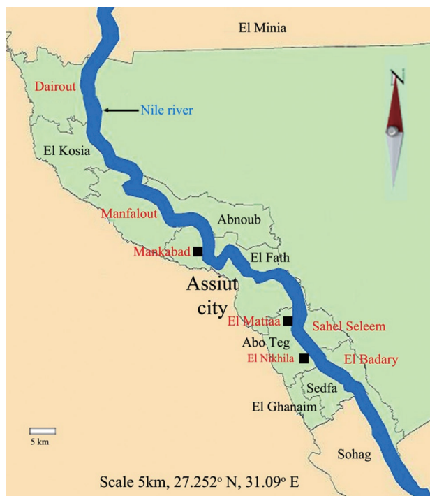
Fig. 1. Map of Assiut Governorate, Egypt. Sites in red color represent areas of mosquito collection ( http://en.Wikipedia.Org/Wiki/Asyut ).

The study was done in Assiut Governorate, Egypt, located about 375 km to the south of Cairo. It was carried out in 7 districts; El-Nikhila, El-Matiaa and Mankabad villages, Sahel Seleem, El-Badary, Dairout, and Manfalout districts (Fig. 1). A total of 2,500 adult female mosquitoes were collected (from March 2012 to December 2013) by using mechanical aspirators [16]. The collected mosquitoes were microscopically identified according to a previously described method [17]. Female mosquitoes were divided into 100 mosquito-pools according