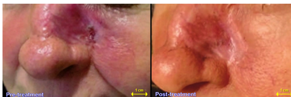
Figure 2 Actinic lesion with a wide erythematous area: a case–control study. The same case–control study 7 days after beginning of T 1 treatment.

Local treatment with detergent and cleaning compounds is based on the use of alkaline solutions: it is advisable to perform all those measures addressed to obtain a gradual cleansing and the development of granulation tissue. Our treatment has shown very good performance not only on small-size ulcers but also on those wider and on the surrounding tissues: the combination of active substances against inflammation, the oxidative killing by the ozonides, the massive action against free radicals carried out by antioxidants, and the barrier effect