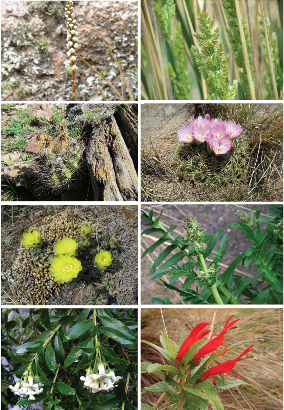
Figure 3. Representative endemic taxa of the Sierras CSL. (Clockwise) Aa aachalensis , Poa stuckertii , Acanthocalycium spiniflorum , Gymnocalycium monvillei , Gymnocalycium andreae , Valeriana ferax , Escalonia cordobensis , Siphocampylus foliosus var. glabratus .