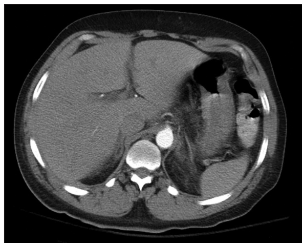
Figure 2: Repeat computed tomography scan revealed near complete resolution of the portal venous gas and mesenteric venous gas

pressure. Empiric intravenous antibiotics and analgesics were administered. Before the patient was taken to the operating room for the diagnostic laparoscopy to find out the cause of portal vein air, CT scan of the abdomen was repeated and it was done 5 h after the first CT abdomen. The repeat CT scan revealed near complete resolution of the portal venous gas and mesenteric venous gas [Figure 2]. Next day abdominal X-rays were done, which were also negative for extra luminal air. Septic workup including blood culture, urine culture, stool for clostridium difficile, HIV, hepatitis A, B, C was negative. Hepatobiliary iminodiacetic acid scan was also negative for acute cholecystitis and showed a patent biliary tree. After 4 days in the hospital, the patient's clinical condition improved and he was subsequently discharged home.