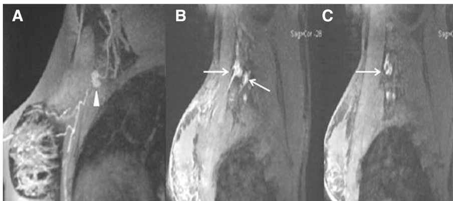
Figure 3 Comparison of MRL images between benign and malignant SLNs. A: Benign SLN in a 41-year-old woman with left breast ductal carcinoma. The lymph node displays homogeneous enhancement (white triangle) in Gd-MRL. B, C: Malignant SLNs in a 48-year-old woman with left breast ductal carcinoma. Heterogeneous enhancement and enhancement defect were found in Gd-MRL (white arrows).

Histopathological examination of sentinel lymph node biopsy is the standard procedure to detect axillary lymph node metastasis. Both radioisotope (technetium-99 m) and blue dyes (isosulfan blue or patent blue) are widely used for lymphatic mapping and SLN identification. The combination of blue dye and radioisotope has a higher SLN identification rate than that of blue dye alone; however, there is no significant difference in the SLN identification rate between blue dye alone versus radioisotope alone [23,24]. However, the radioguided approach to SLN identification requires utilization of radioisotope (technetium-99 m) and gamma detection probe equipment