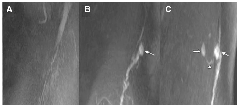
Figure 1 Gd-MRL images in a 46-year-old patient with left breast ductal carcinoma. Compared with pre-contrast images (A), the axillary lymphatic pathway was dynamically stained 9 min (B) and 18 min after contrast injection (C). The SLN could be easily identified on Gd-MRL (white thin arrow). One distant node (white thick arrow) and its connection lymph vessel (white triangle) with an SLN are also displayed.

In Gd-MRL imaging, 28 M-SLNs were confirmed to have metastases; 25 of them showed heterogeneous