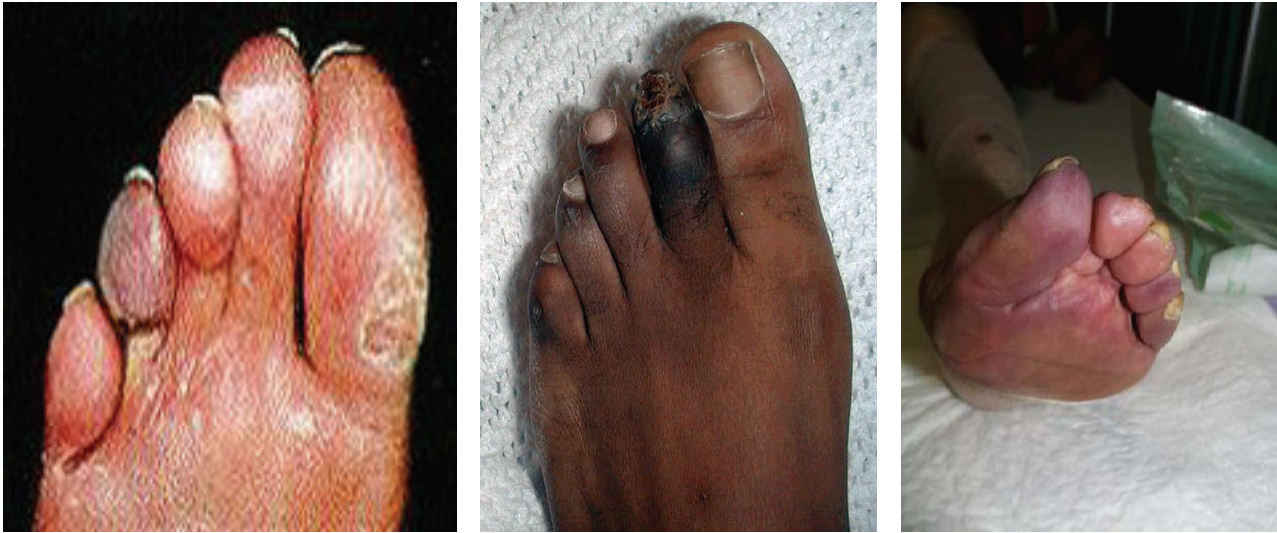
FIGURE 3: Ischemic diabetic foot.