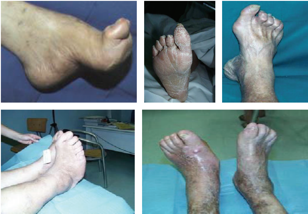
FIGURE 1: Neuropathic diabetic foot.