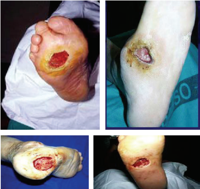
FIGURE 2: Neuropathic ulcers.