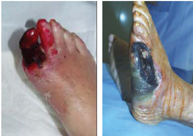
FIGURE 4: Infected diabetic foot.

ischemic stroke) and on a prospective evaluation (new onset TIA and stroke on a 5-year follow-up). The most prevalent subtypes of stroke were lacunar and LAAS subtype with a slight higher prevalence of the lacunar subtype and this finding could suggest a role of both microvascular disease and atherosclerotic macroangiopathies, a determinant of vascular morbidity in patients with diabetic foot. The higher cardiovascular risk associated with diabetic foot may be related to a cumulative effect of the single risk factor linked to neuropathy and PAD, which are two well-known medical conditions recently associated with increased cardiovascular morbidity [18, 19], but another explanation could be recognized in the role of microangiopathy as a determinant of overall vascular risk. Nevertheless, because the groups evaluated in this study did not start with balanced CV risk factors and CV disease, authors cannot exactly correct for so many other powerful indicators especially with small numbers and relatively few