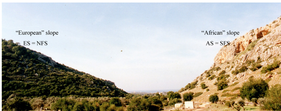
Fig 1. The "Evolution Canyon" I at Lower Nahal Oren, Mount Carmel, Israel. Note the "African" savannah AS = SFS slope versus the forested ES = NFS slope. Higher terrestrial species richness occurs on the more stressful tropical AS. Aquatic species richness is higher on the milder, temperate cool and humid "European" slope (ES).