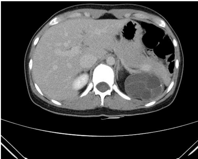
Fig. 1. Abdominal computed tomography shows a 6.5 cm sized multiloculated cystic mass in left retroperitoneal space just below spleen.