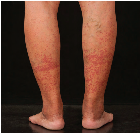
Fig. 1. Lower limb purpuric rash.