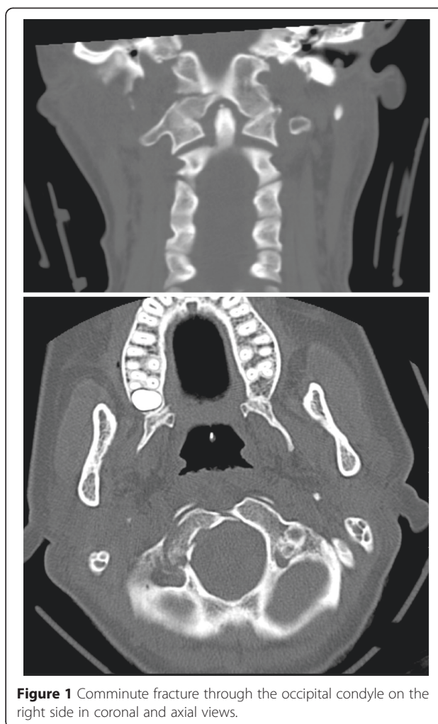
Figure 1 Comminute fracture through the occipital condyle on the right side in coronal and axial views.

According to the the patient she started noticing hoarseness and difficulties swallowing about six weeks after the accident. At this point she was gradually