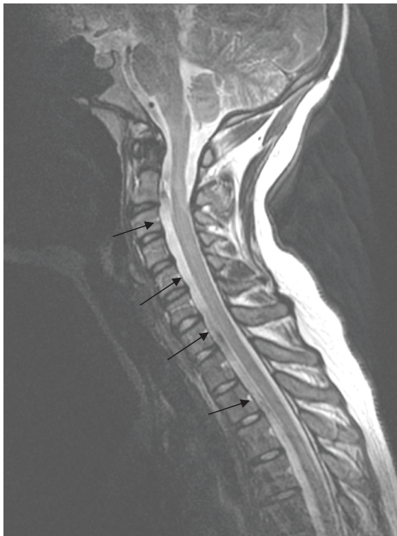
Figure 2 T2-weighted MRI of the spinal canal in the sagittal plane demonstrates a probable arachnoid cyst located anterior to the spinal cord from C2 and downwards. Additional MRI of the thoracic spine showed extension down to Th10. The MRI was performed one year after the accident.

cases and is referred in more detail below. Thus one has a good basis for the diagnosis of the syndrome in this trauma patient.