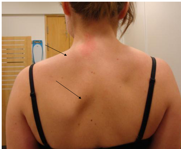
Figure 3 Left sided atrophy of the trapezius muscle and scapular winging (arrows).

Occipital condyle fractures are associated with high-energy blunt trauma with significant cranio-cervical torque or axial loading. In most cases neurological