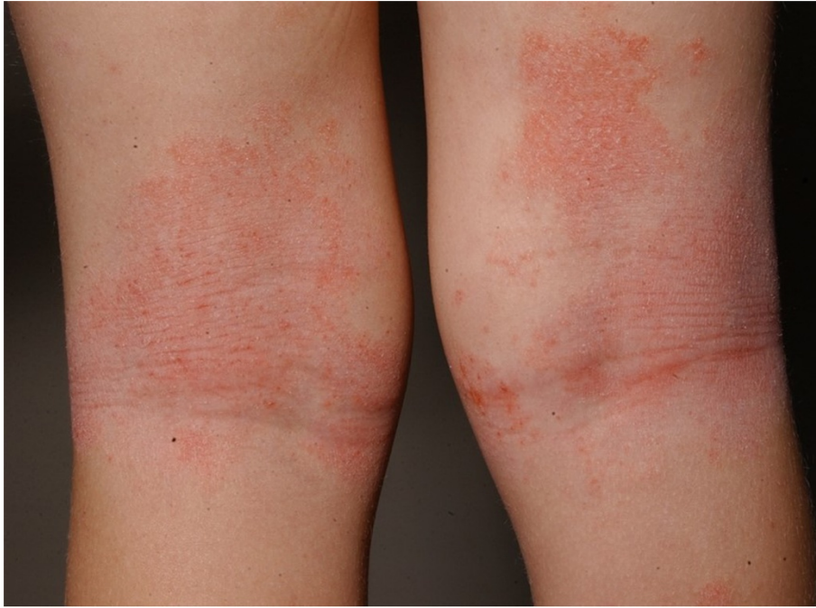
Figure 1 Typical lichenified atopic dermatitis in the kneefolds.

role in the pathogenesis of the disease. Changes in the balance of the microbiome and the host's cutaneous immune response have been shown to aggravate atopic dermatitis and lead to secondary skin infections [17] (Figure 2). During flares, patients with atopic dermatitis