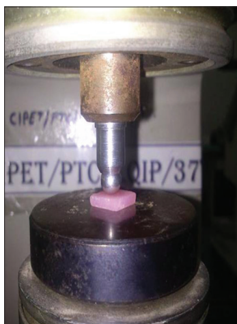
Figure 3: Testing of specimen for Rockwell hardness.