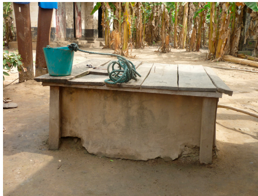
Figure 1. Example of a covered well surrounded by a frame in the village of Asankare, Asante Akyem District, Ghana.

biochemical identification strip (bioMérieux, Marcy L'etoile, France). Susceptibility was tested for a set of antibiotics commonly used in the study area, i.e. , ampicillin, ampicillin/sulbactam, ceftriaxone, chloramphenicol, ciprofloxacin, cotrimoxazole, nalidixic acid (used as a screening test for ciprofloxacin) and tetracycline, following the Clinical and Laboratory Standards Institute (CLSI) guidelines. Salmonella isolates were stored at -80\text{ }^{\circ}\text{C} until transport to Germany on dry ice. For all Salmonella isolates, the serovar was determined by slide agglutination following the Max von Gruber method [11] using Salmonella specific antisera (SIFIN GmbH, Berlin, Germany) and the White-Kauffmann-Le Minor Scheme [12] (carried out at the Bernhard Nocht Institute for Tropical Medicine).