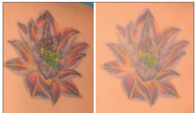
Figure 4: Difficult to treat multi-colored tattoo on the back, before and after 4 treatments with 755 nm QS Alexandrite laser