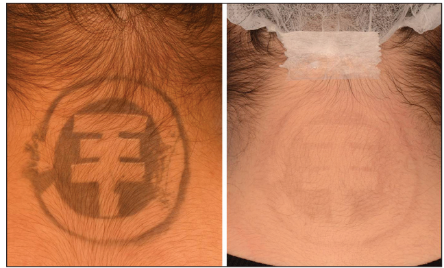
Figure 3: Black amateur tattoo on nape of neck before and after 2 treatments with 1064 nm QS Nd:YAG laser