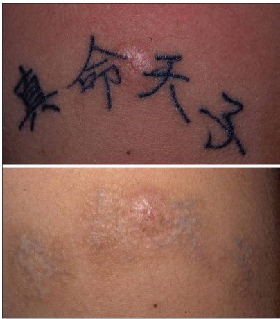
Figure 1: Showing good resolution of dark blue tattoo using the QS Nd:YAG laser after 5 treatment. Noticed textural changes and mild post inflammatory hyperpigmentation and silhouette of old tattoo

absorption by epidermal melanin and reduce the risk of complications.