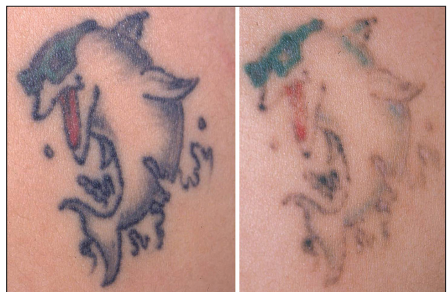
Figure 5: Show multicolored tattoo partially removed with the QS Nd:YAG laser. Note persistence of green pigment which are generally unresponsive to Nd:YAG laser.

Lapidoth et al. treated 404 Ethiopian patients (skin types V and VI) with blue/black tattoos with the 1064 nm QS Nd:YAG (380 patients) or QS ruby laser (24 patients), and reported a clearance of 75-100% in 92% of patients after 3-6 laser treatments (average 3.6) at intervals of at