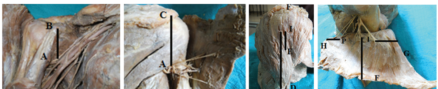
Table/Fig-4: Measuring the distance of axillary nerve (a) from the anteromedial aspect of tip of coracoid process (b) Table/Fig-5: Measuring the distance of axillary nerve (a) from posterolateral aspect of acromion process (c) Table/Fig-6: Measuring the distance of Anterior branch (I) of Axillary nerve from midpoint of Deltoid muscle insertion (D) & from midpoint of vertical length of Deltoid muscle (E). [F- Upper border of Deltoid] Table/Fig-7: Measuring the distance of anterior (I) & posterior branches (P) of axillary nerve from anterior border of deltoid (G), from posterior border of deltoid (H) & upper border of deltoid (F)

The anterior branch of axillary nerve found to lie beneath the deltoid muscle at a mean distance of 6.71 \pm 0.47 cm and 2.45 \pm 0.48 cm, above the midpoint of deltoid muscle insertion and from the midpoint of vertical length of deltoid muscle respectively. Similarly, the mean distance between the nerve before it entered the quadrangular space (just prior its division) & the anteromedial aspect of tip of coracoid process was 3.56 \pm 0.51 cm. The axillary nerve before it enters the deltoid muscle found to run at a mean distance of 7.46 \pm 0.99 cm from the posterolateral aspect of acromion process [Table/Fig-9]. The mean vertical distance of entering point of axillary nerve from the upper deltoid border was - anteriorly: 4.94 \pm 0.86 cm, middle: 5.14 \pm 0.90 & posteriorly: 5.44 \pm 0.95 cm. Similarly, the mean horizontal distance was - anteriorly: 4.54 \pm 0.65 & posteriorly: 3.22 \pm 0.53 [Table/Fig-9]. The mean height, mean width & mean depth of Quadrangular space respectively was 2.23 \pm 0.40 cm, 2.19 \pm 0.22 cm & 1.25 \pm 0.14 cm.