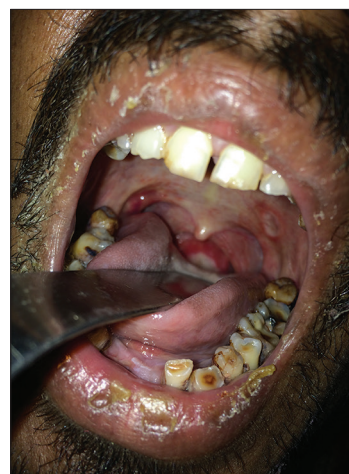
Figure 2: Oral ulcerations