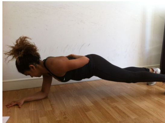
One Arm Plank