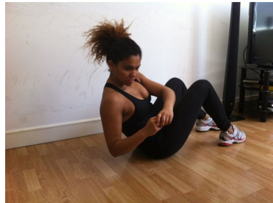
Russian Twister Week 5, 6 = 3 x 45 reps