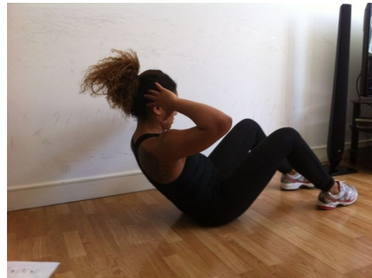
Abdominal Crunch Week 5, 6 = 3 x 45 reps