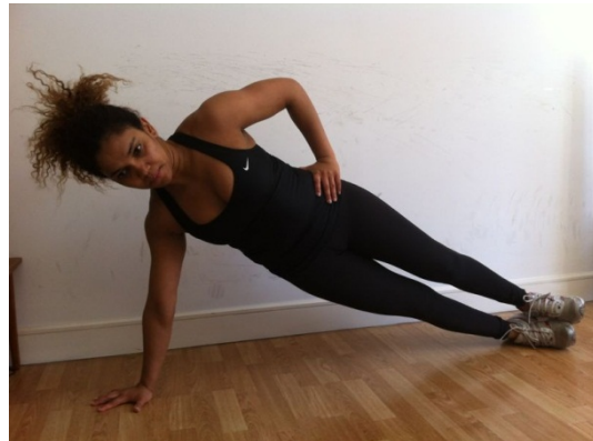
One Arm Side Plank