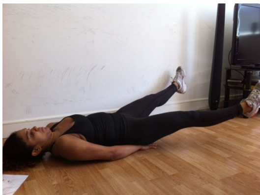
Spilt Legs Scissors Week 1, 2 = 3 x 20 reps