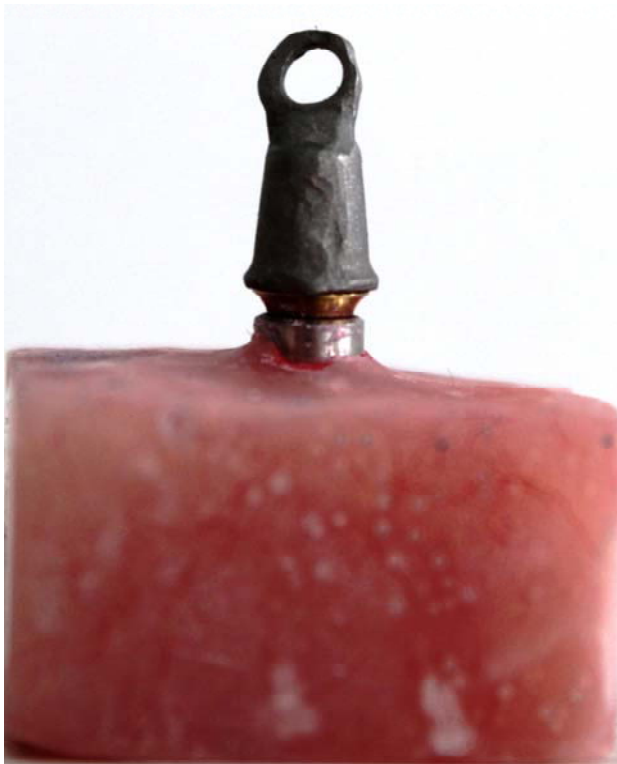
Figure 3. The casting with a loop attachment.

machine (Zwick CombH- & Co/Roell.Z020, Ulm, Germany) by clamping them directly onto the loop attachment. The machine was used to apply vertical tensile forces at a crosshead speed of 5 mm per minute, to dislodge the castings from the abutments. The peak load to dislodgement was documented (N) and used to indicate the retentive values. Before testing each new casting, abutments were cleaned of remaining cements. To compare the groups, one-way analysis of variance (one-way ANOVA) and pairwise comparisons test (LSD) were used.