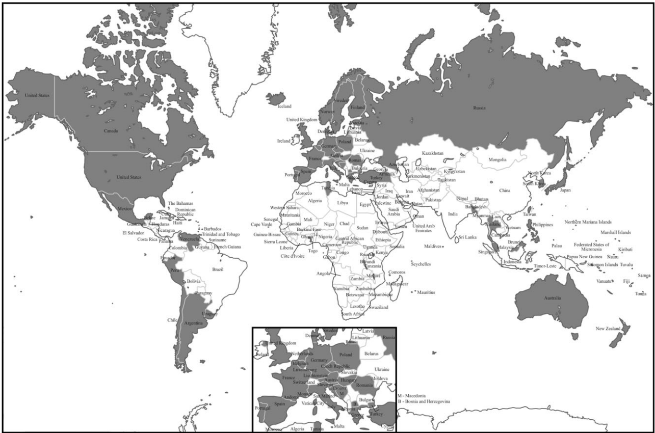
Fig. 1. Map of countries participating in the EVEREST study.

exploring the reasons behind the higher RRT incidence in Germany compared to England and Wales [26]. While such approaches provide interesting anecdotes and can be hypothesis generating, they are unable to comment on the relative importance of individual medical or non-medical factors—for this, quantitative data for each potential explanatory factor, collected in a large number of countries, are required.