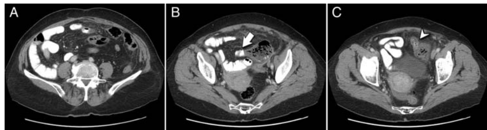
Figure 1 (A) CT scan showing complete intestinal malrotation with the entire colon shifted to the left and small bowel (with oral contrast) moved to the right. (B) Caecum positioned at the lower pelvis (arrow pointing to terminal ileum). (C) Appendix presented dilation and thickening suggestive of acute perforated appendicitis (arrowhead pointing to appendix).

A review from 2010 encountered 95 published cases of left-sided appendicitis, with only 23 associated with intestinal malrotation. 1 Laparoscopic appendectomies for acute appendicitis associated