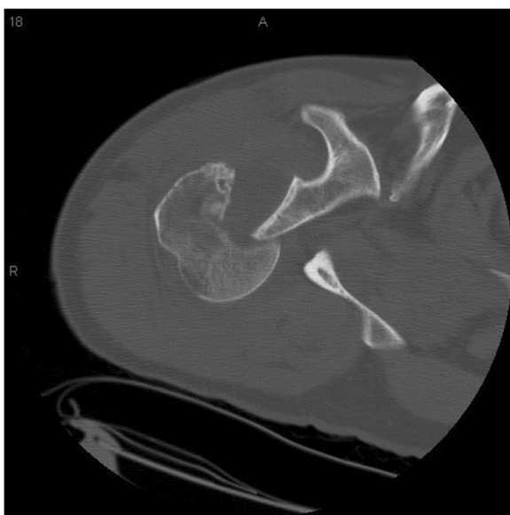
Figure 2 CT scan of the right shoulder axial view showing the posterior dislocation and reverse Hill Sachs lesion.

Posterior locked shoulder dislocation fracture is a rare injury comprising 2–4% of all shoulder dislocations. The decision for the treatment of chronic posterior