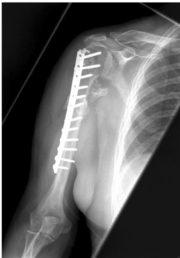
Figure 4 Anteroposterior view of the right shoulder after the surgery showing the well fixed implant.

shoulder has been described [3]. Also retrograde elevation of the depressed articular surface [13,14] and subscapularis tendon transfer for the lesions with an extent of 20–50% of the head surface [15] have been previously reported.