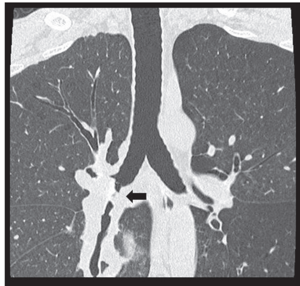
Figure 1. Chest computed tomography in Case 1 shows stenosis of the intermediate bronchus (arrow).

He developed ischemic change of the bronchial anastomosis after transplantation, resulting in bronchial stenosis. This made it difficult for him to expectorate sputum, so frequent bronchoscopic airway cleaning was needed. Infectious episodes were successfully treated by intravenous antibiotics, but the bronchial stenosis worsened gradually (Figure 1). Therefore, a Y-shaped airway silicone stent was inserted 5 months after