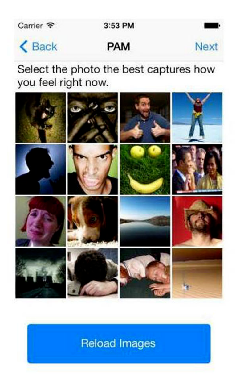
Figure 3. Tracking App screen shots for affect measure.